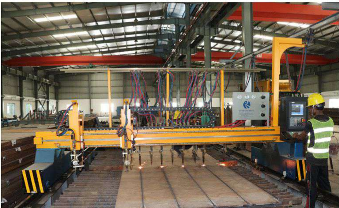
CNC Flame Cutting Machine