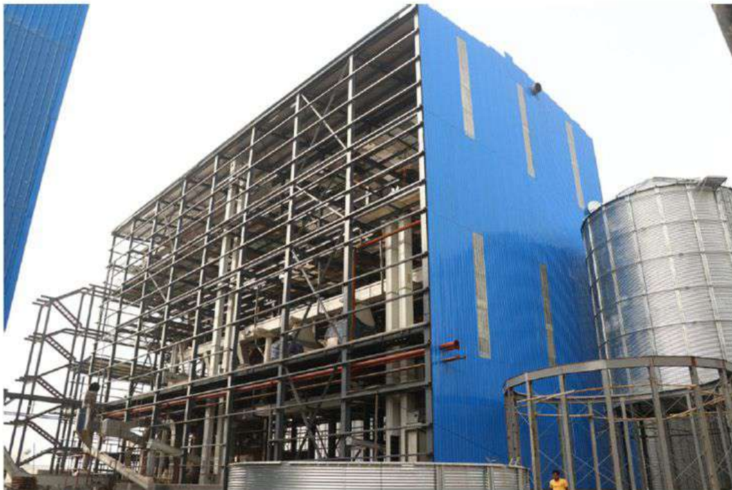
Globe Edible Oil Factory at Rupganj