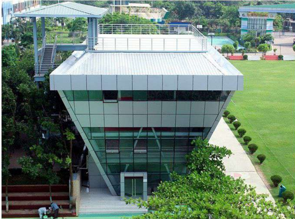
Mosque at Permanent Campus of Daffodil International University