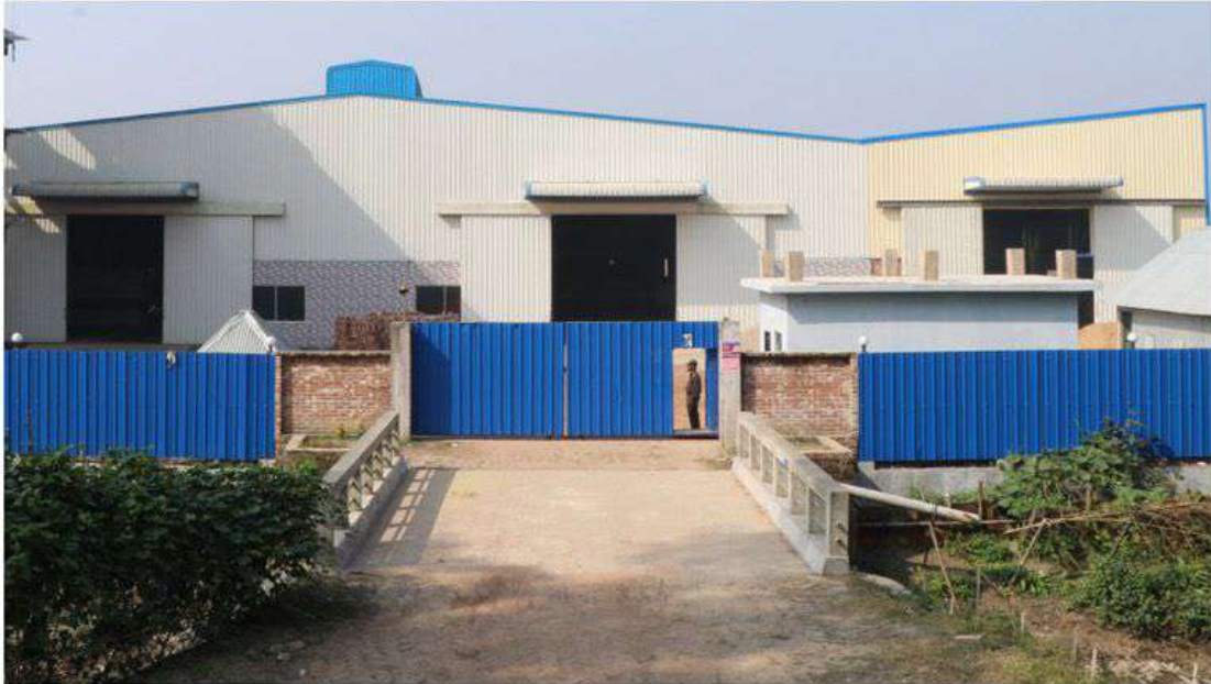
Factory of SteelCraft PEB Ltd