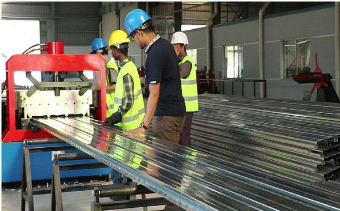
Deck Forming Machine