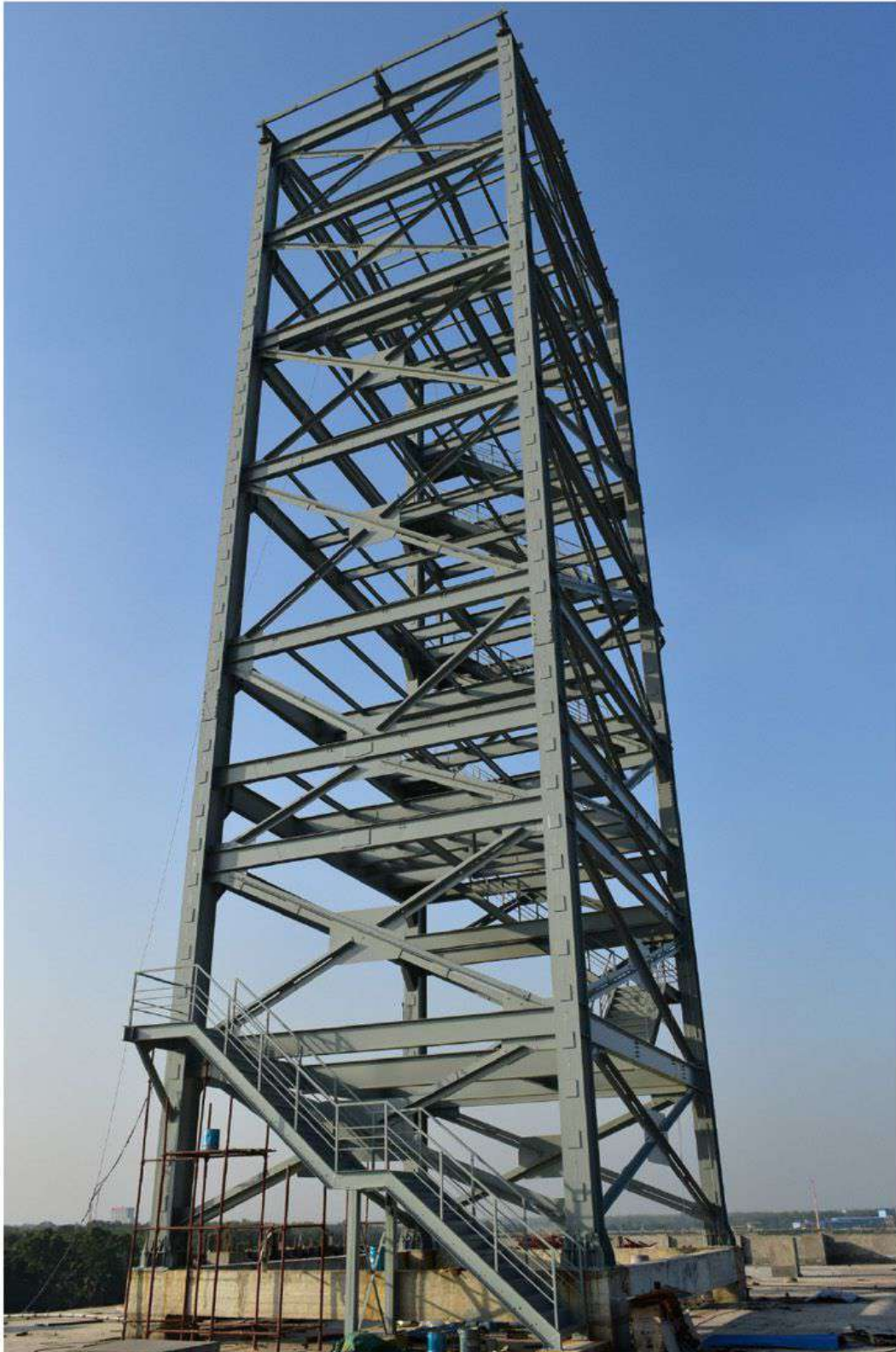
120 ft Height Steel Tower on 55 ft Level from Ground For Dryer Portion of Nice Synthetic Yarn Mills Ltd, Noman Group

SteelCraft PEB Ltd. Crafting your building by steel