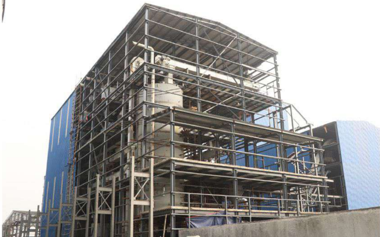
Globe Edible Oil Factory at Rupganj