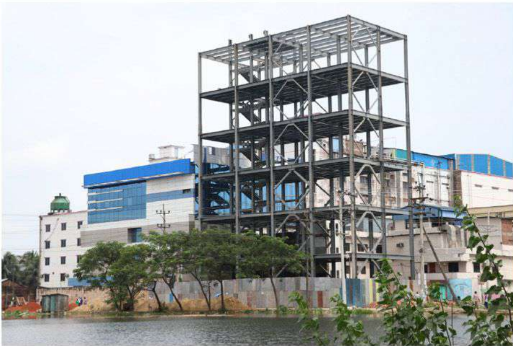
Globe Pharmaceuticals Factory at Noakhali

SteelCraft PEB Ltd. Crafting your building by steel