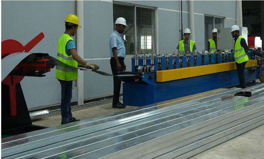
Purlin Forming Machine

SteelCraft PEB Ltd. Crafting your building by steel