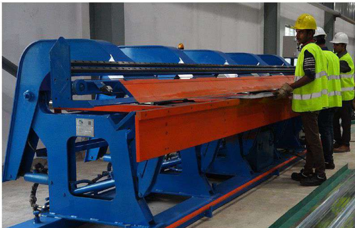
Capping, Flashing, Accessories Fabrication