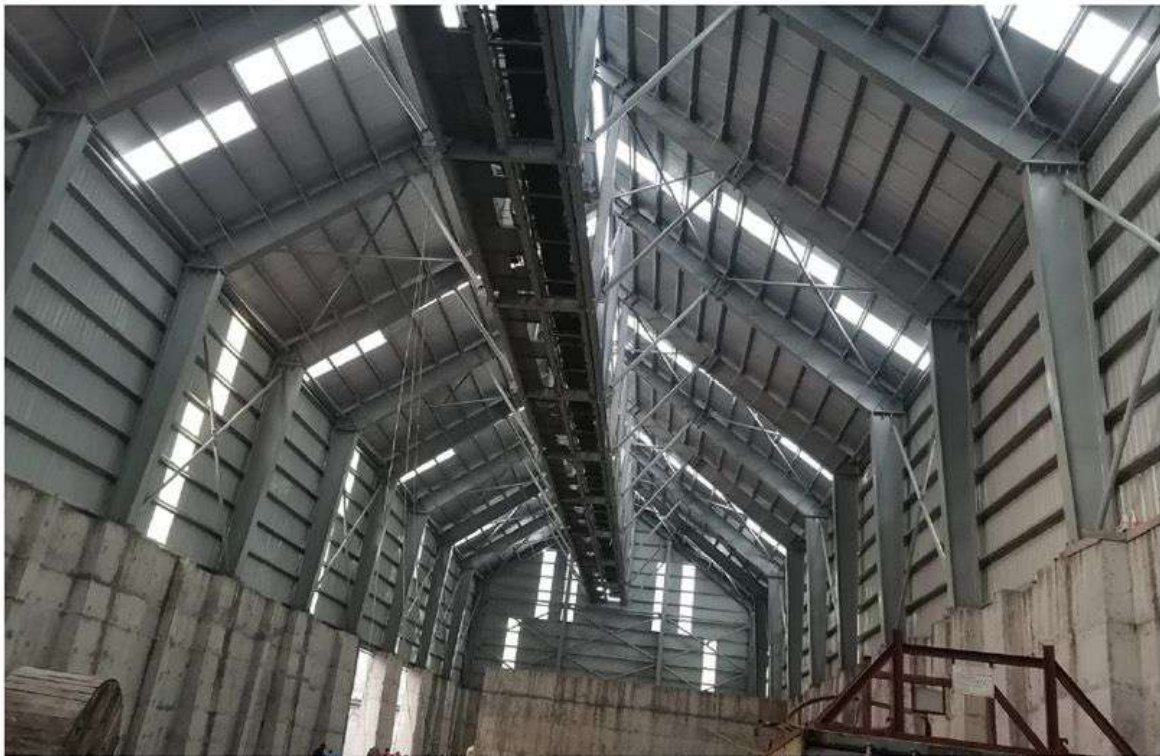
Slag & Gypsum Shed of Shun Shing Cement Industries Ltd @ Chattogram

SteelCraft PEB Ltd. Crafting your building by steel