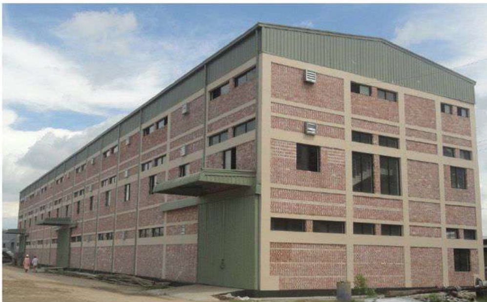
Three Storied Ware House of Shun Shing Packaging Industries Ltd.