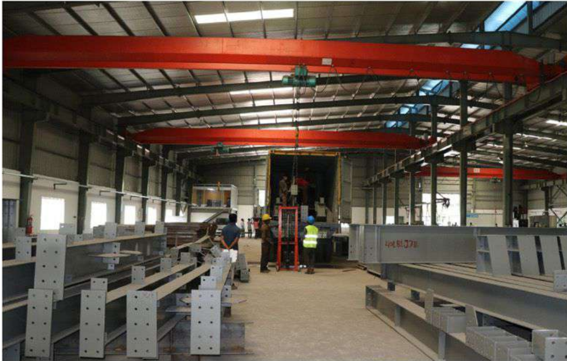
Finished Products & Delivery