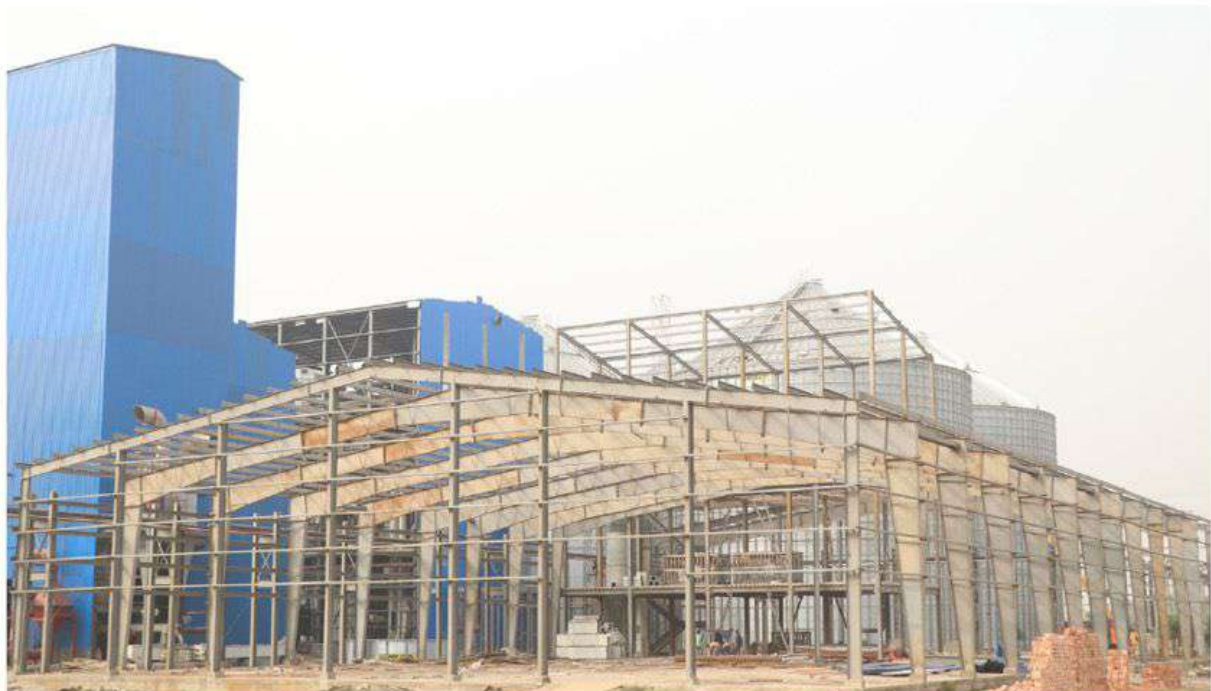
Globe Edible Oil Factory at Rupganj