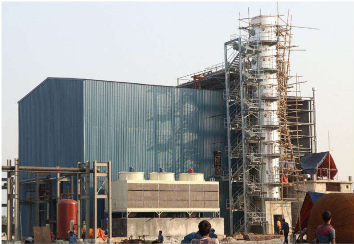
Globe Edible Oil Factory at Rupganj

SteelCraft PEB Ltd. Crafting your building by steel