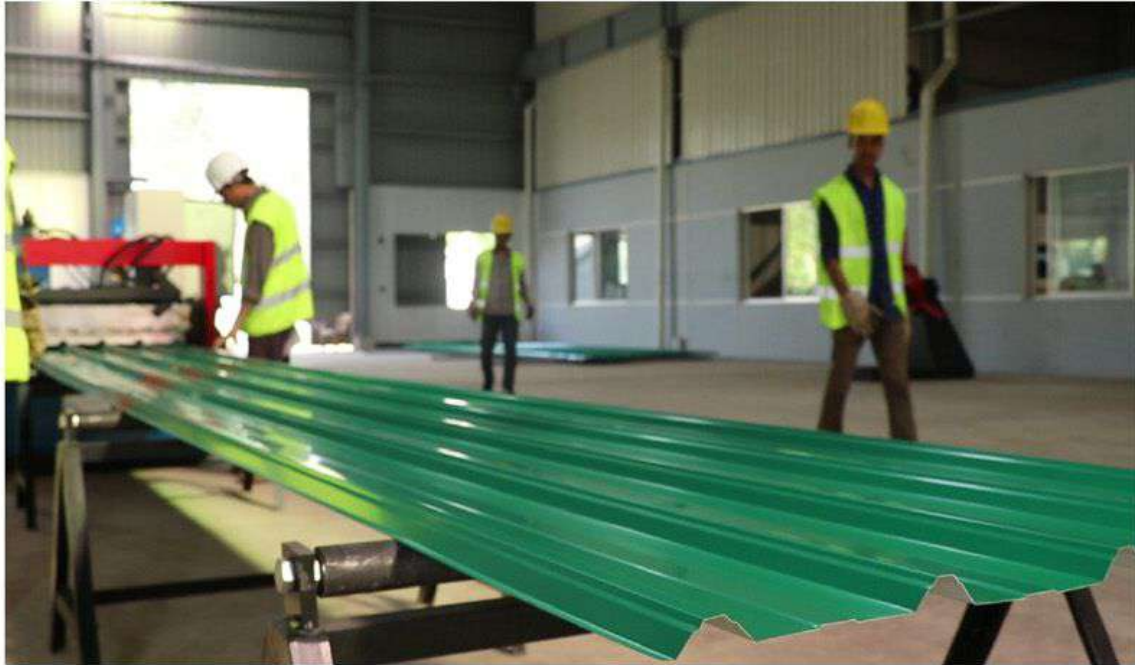
Colour Sheet Profile Machine

SteelCraft PEB Ltd. Crafting your building by steel